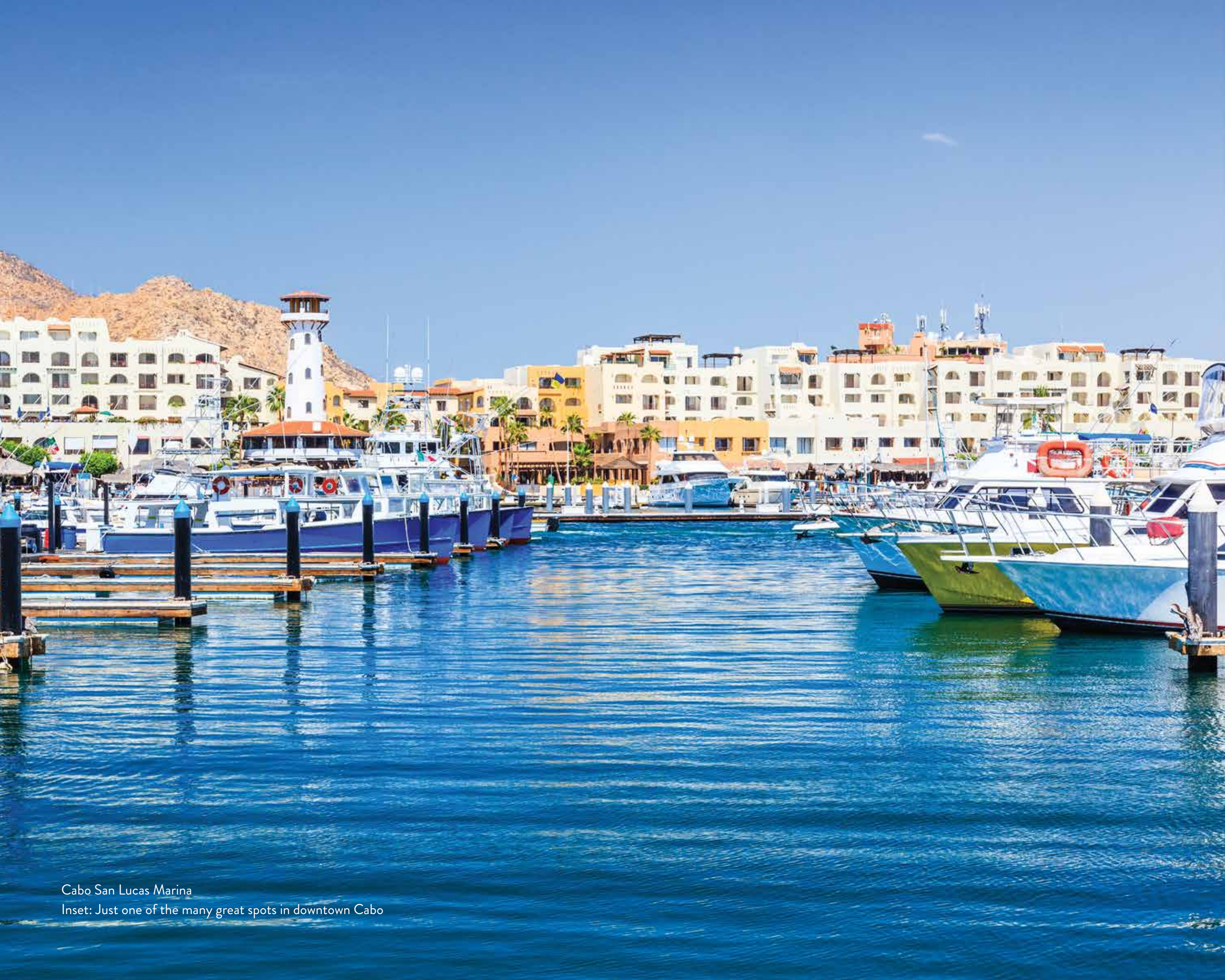
Cabo San Lucas Marina Inset: Just one of the many great spots in downtown Cabo