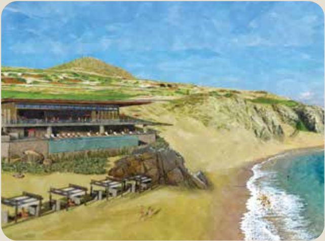
Inset: Rendering of proposed Beach House at Old Lighthouse Club