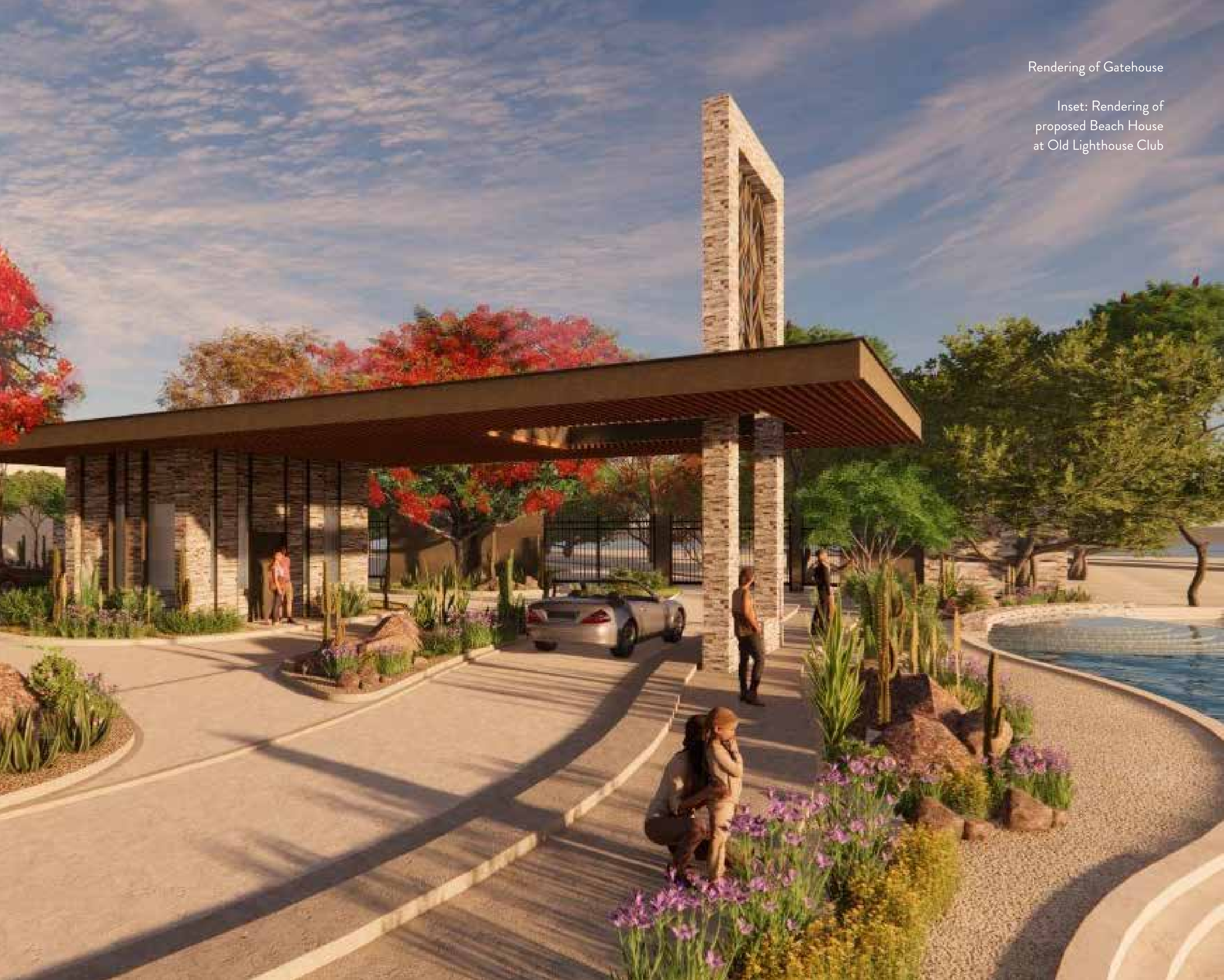
Rendering of Gatehouse