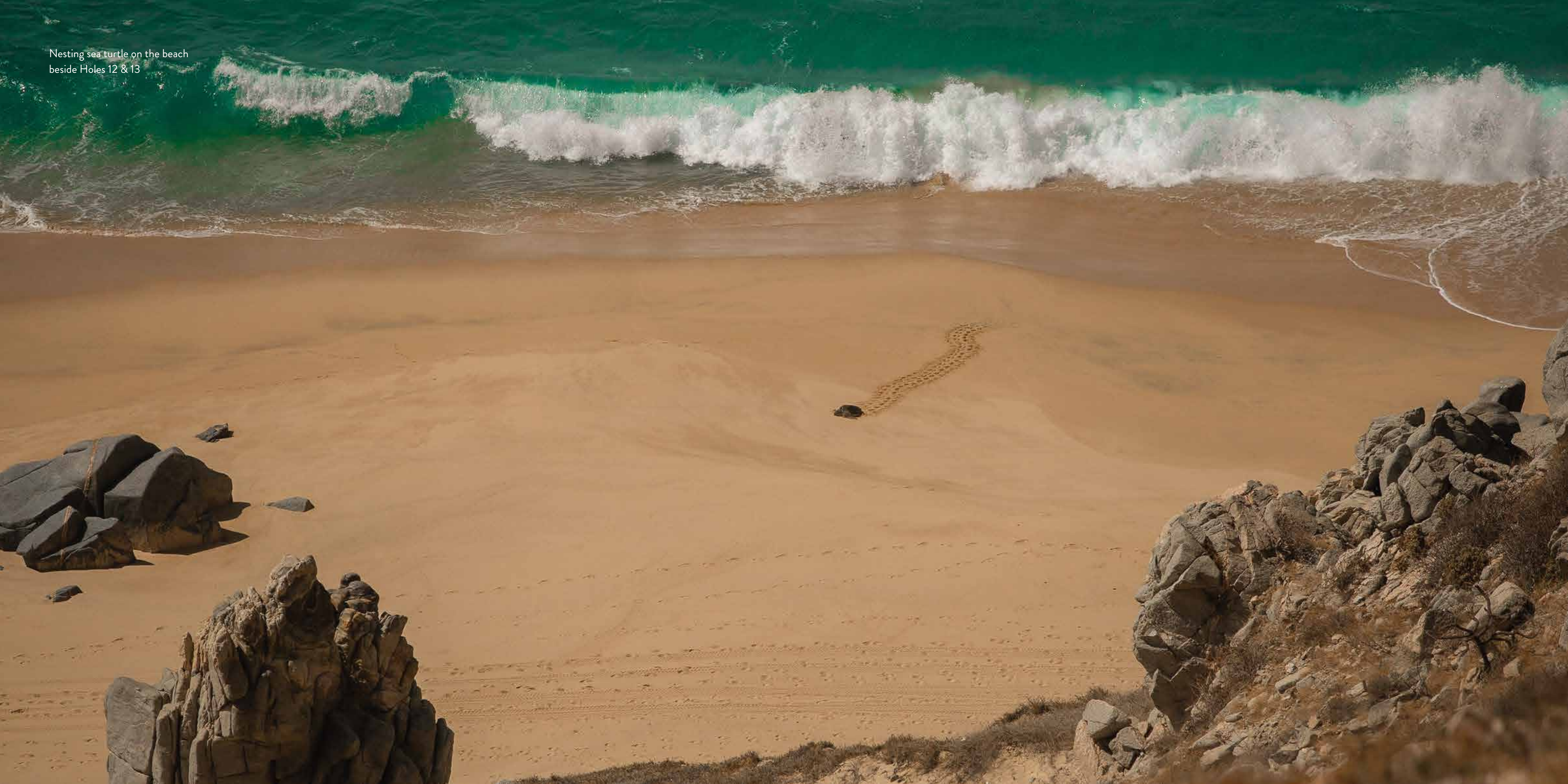
Nesting sea turtle on the beach beside Holes 12 & 13