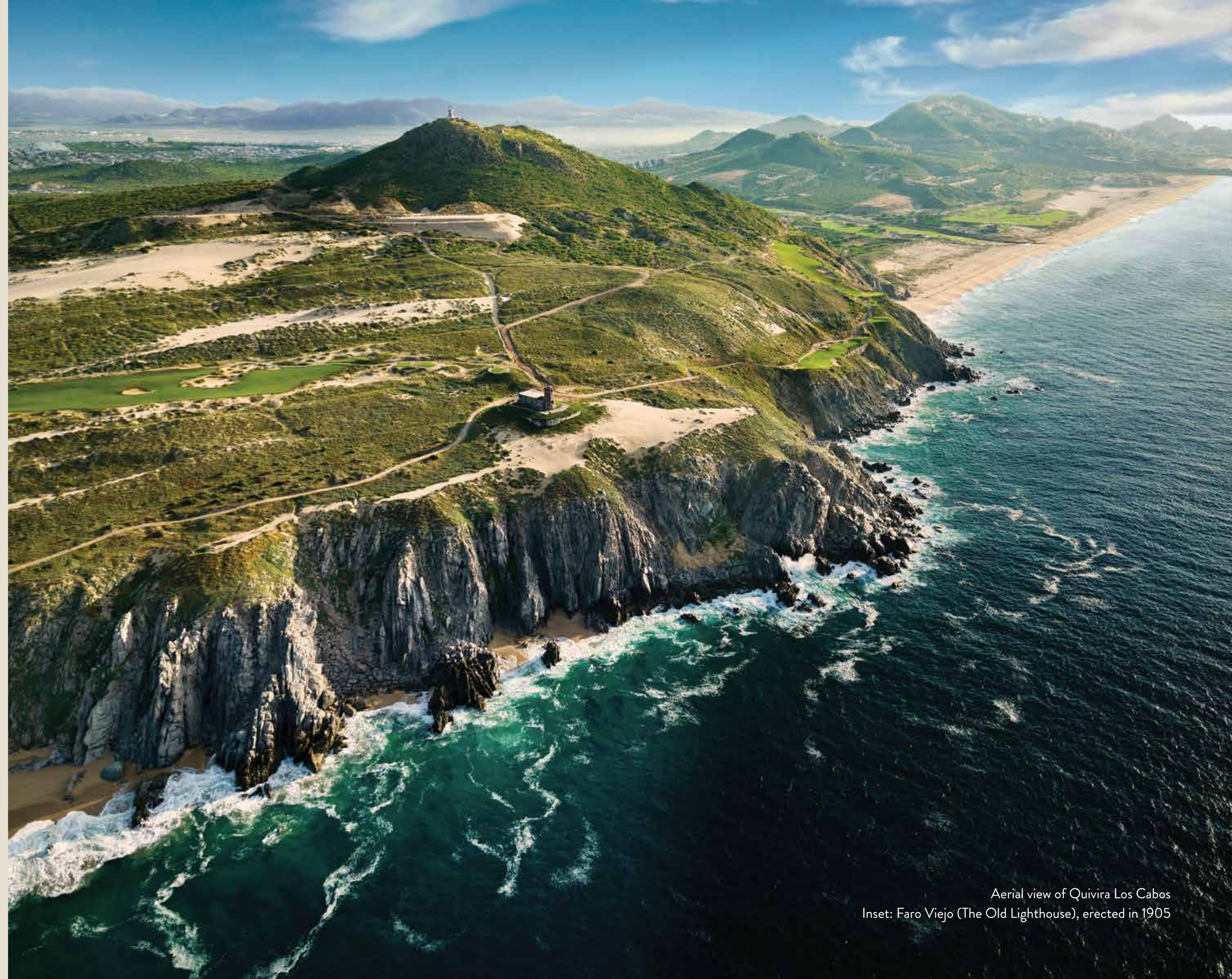
Aerial view of Quivira Los Cabos Inset: Faro Viejo (The Old Lighthouse), erected in 1905

Spectacular ocean and golf view homesites are nestled atop dramatic dunes nearly 300 feet above the ocean, offered from $2.75 million.