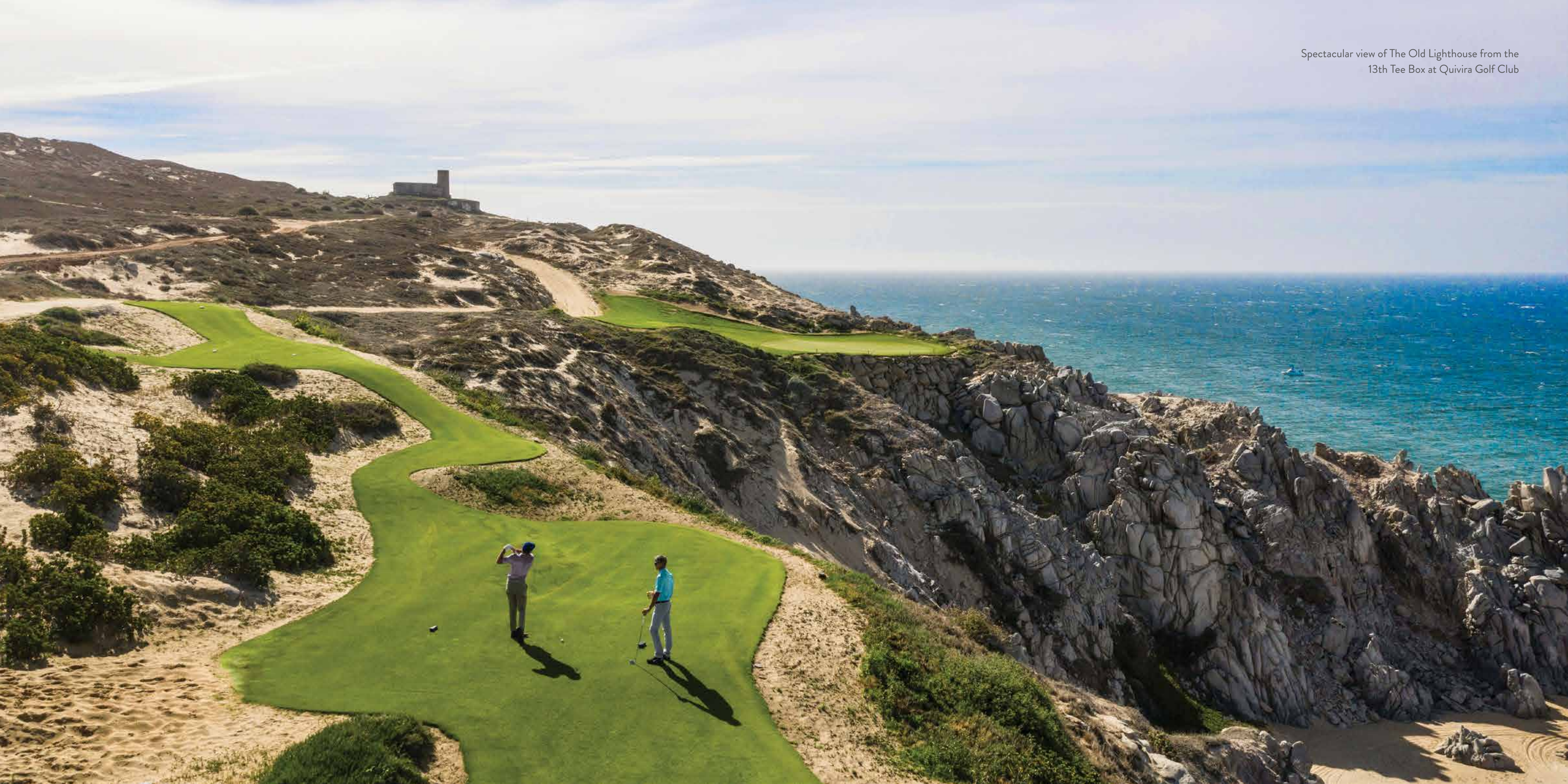
Spectacular view of The Old Lighthouse from the 13th Tee Box at Quivira Golf Club